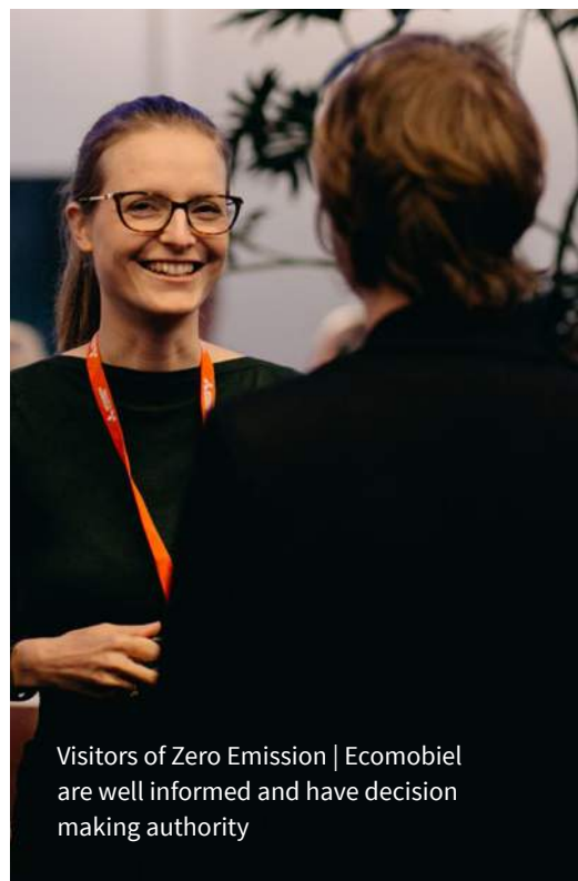
Visitors of Zero Emission | Ecomobiel are well informed and have decision making authority